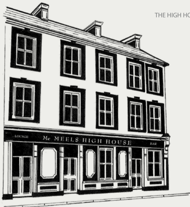
THE HIGH HOUSE

The High House is a significant building on Main Street and is also situated on one of the oldest sites in the village. Interior building renovation work here in 1959 unearthed the remains of a Bronze Age tomb.